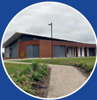
Manurewa Centre Opens 18 July