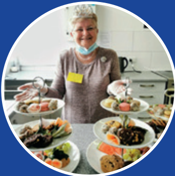
Communicare Charity Cookbook OUT SOON